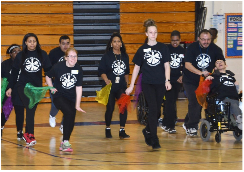
Students from the Unified Dance and Leadership course perform at the end-of-semester celebration.

SHAPE America - Society of Health and Physical Educators is the national organization that serves as the voice for 200,000+ health and physical education professionals across the nation. Since its founding in 1885, the organization has defined excellence in physical education, and our National Standards for K-12 Physical Education serve as the foundation for well-designed physical education programs across the country. We provide programs, resources and advocacy that support an inclusive, active, kinder, and healthier school culture and champion health and physical educators at every level, from preschool to university graduate programs. Our extensive community includes members, advocates and supporters, as well as 51 state affiliate organizations (including the District of Columbia). Together we are working, in and out of schools, to prepare every child to lead a healthy, physically active life. For more information, visit shapeamerica.org.